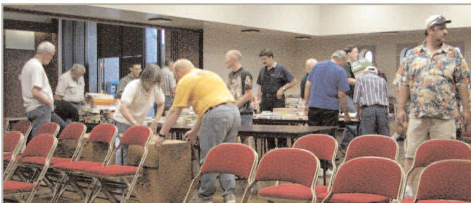
July meeting highlights, clockwise from above: Setup in full gear; for some members, the excitement just never ends; the Swap Meet.

State Fair is coming up soon, and we will be