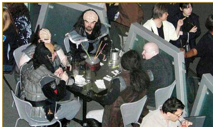
Where else will you ever be able to see a group of Klingons sitting down for a meal?

During the recent Star Trek Convention (early August), I was one of many who found themselves taking literally hundreds of photos of the museum exhibit and the rest of the attraction, soon to be the only way to experience it.