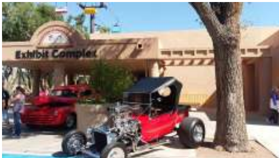
The first ever Albuquerque Street Rod Nationals were held at Expo New Mexico August 23-25.