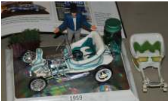
In Progress Builds