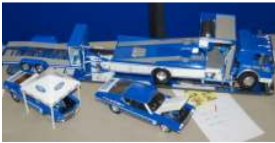
First Place – Eddie Corbin