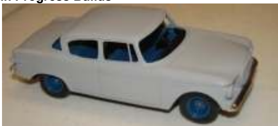
MCW Studebaker SCCA Road Racer