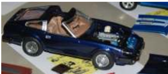
3d Pace (Tie)- Kyle Nissan 280Z, Chuck 29 Ford