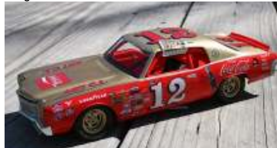
Above - internet photo of a completed kit.

So if you're into building vintage historic NASCAR models, this kit belongs in your collection. Grab one, and end the summer with a bang! ED