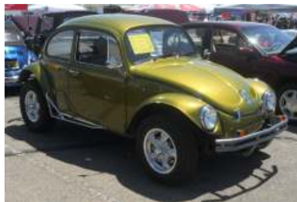
It was pretty hot out in the parking lot, here are some of the cars on display.