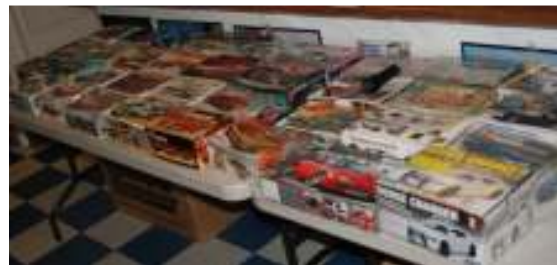
Kits for Sale!