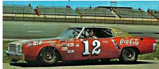
Below - the real thing