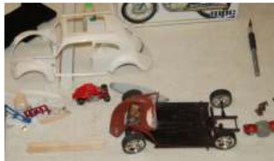
Revell 1/16 Scale VW Beetle