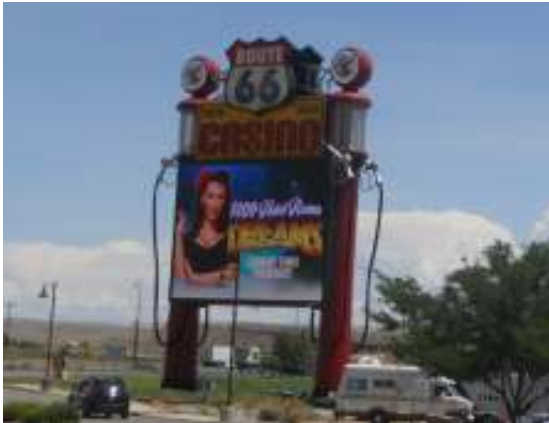
The 2019 Route 66 Casino Calendar Car Show was held August 3-4.