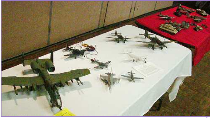
March meeting highlights, clockwise from above: Huge turnout on the Display Only table ("bring your oldest model"); members milling about before the meeting; the meeting in progress