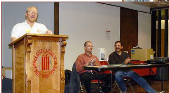
March meeting highlights, left to right: the business meeting in progress; kits donated to the troops; award time