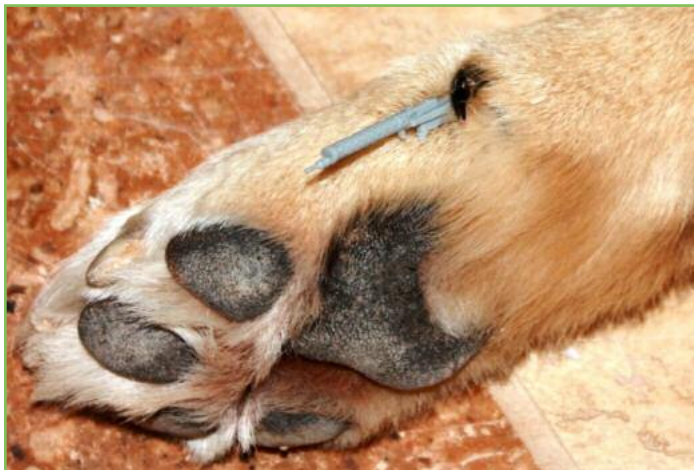
Figure 2. Close-up image of affected dog paw with high exposure levels to polystyrene outgassing

If there are no pets in the area, keep an eye out for changes to fingernails or toenails in color or shape. The fumes from modern polystyrene will impart a grey or tan color to the patient's extremities. If there is a large