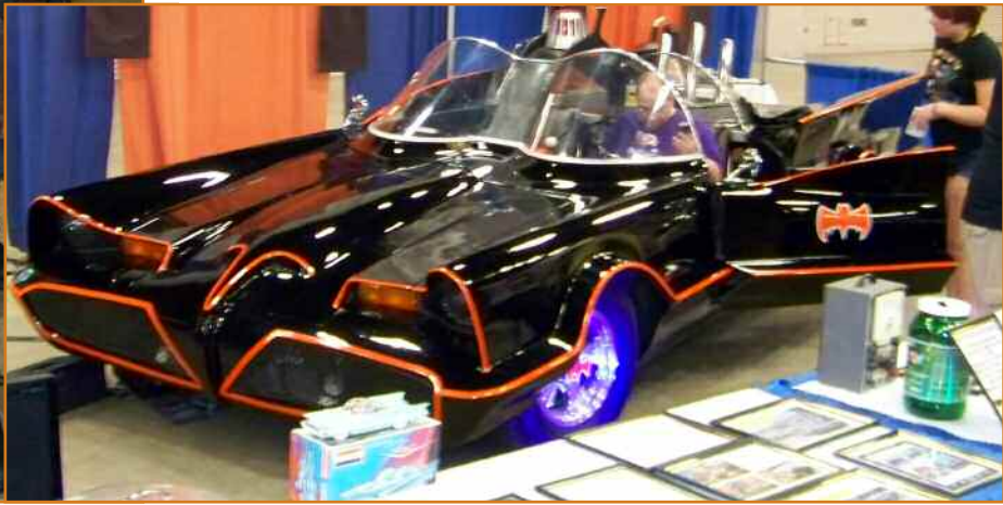
Bottom: Ms. Marvel teams up with Han Solo, and the Chuck Barris / Adam West Batmobile—considered by some of us to be the Batmobile—on display.