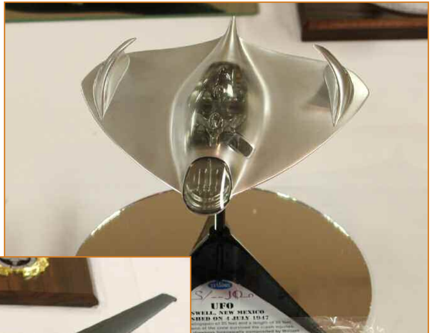
Below: IPMS 50th Anniversary award winner, a U-2 built by Chuck DeWitt.