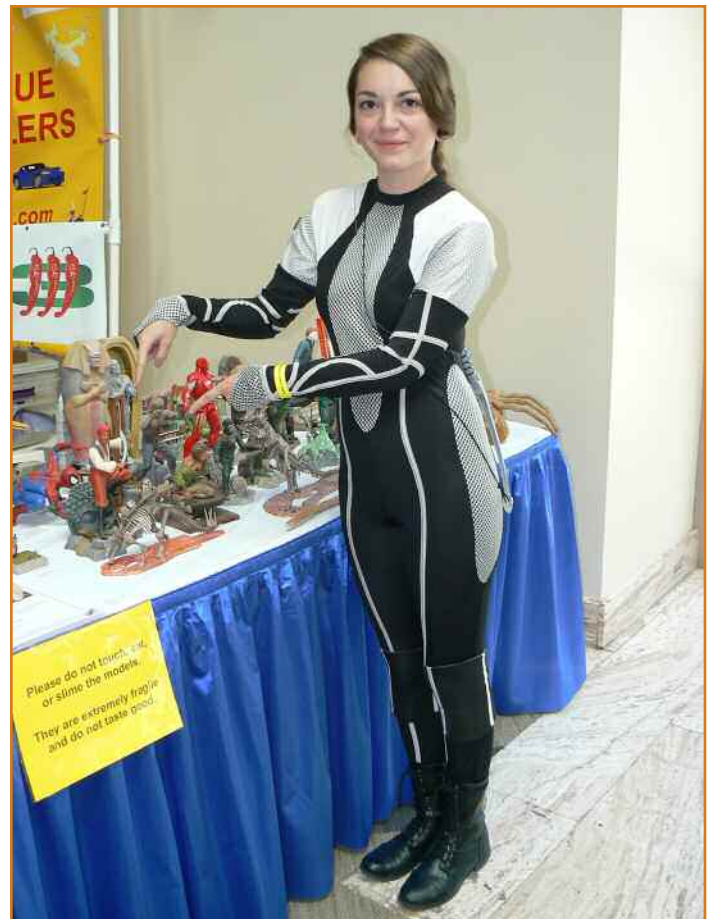
Katniss from the Hunger Games was one of our celebrity judges.

We had a good turnout of ASM members to man our station