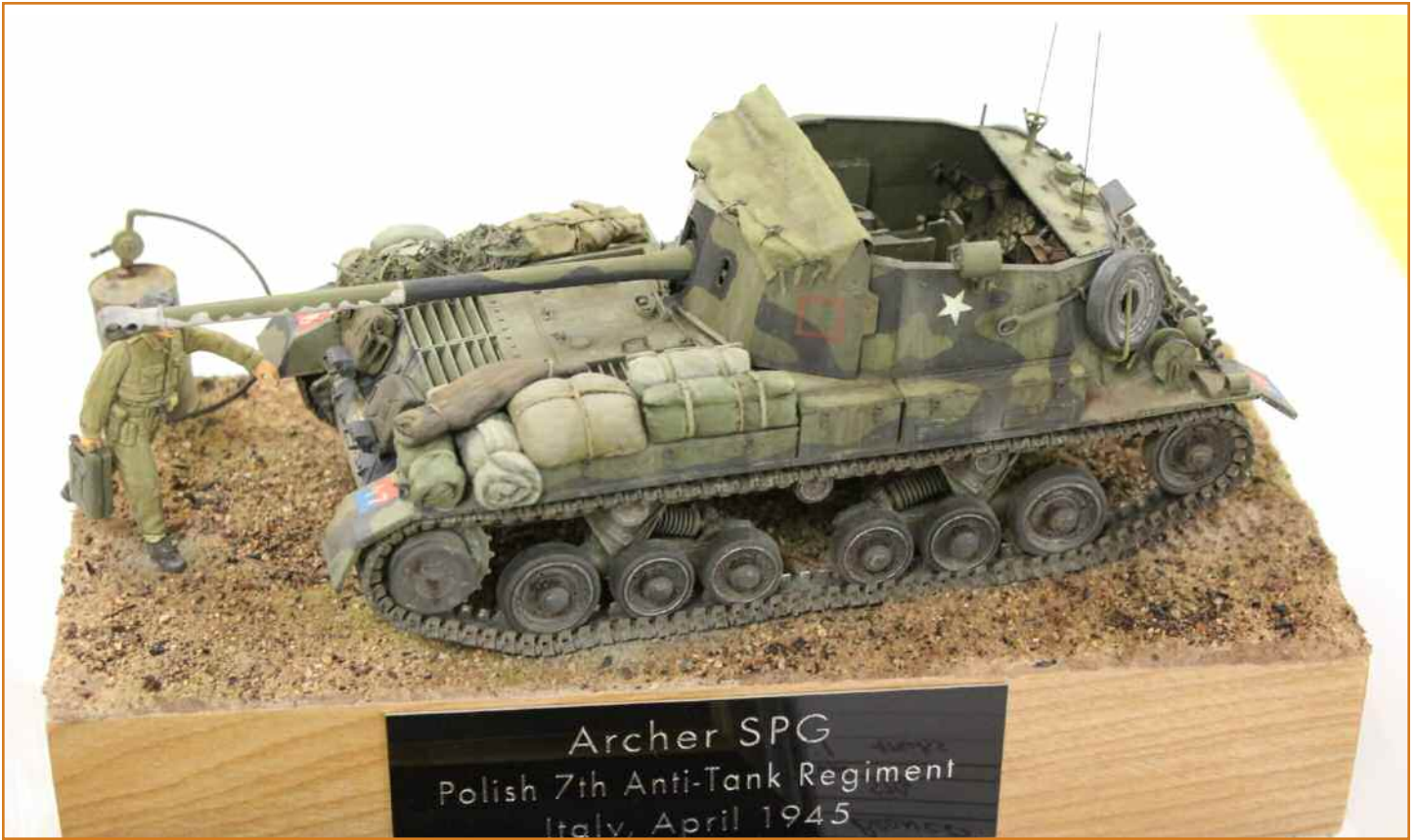
Above: Best Military Vehicle. Below: HMS Isis, which won not only Best Ship, but also People's Choice and Best of Show.