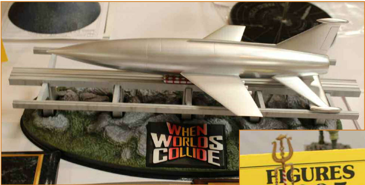
Top to Bottom: Best Science Fiction, Best Figure, Best Aircraft.