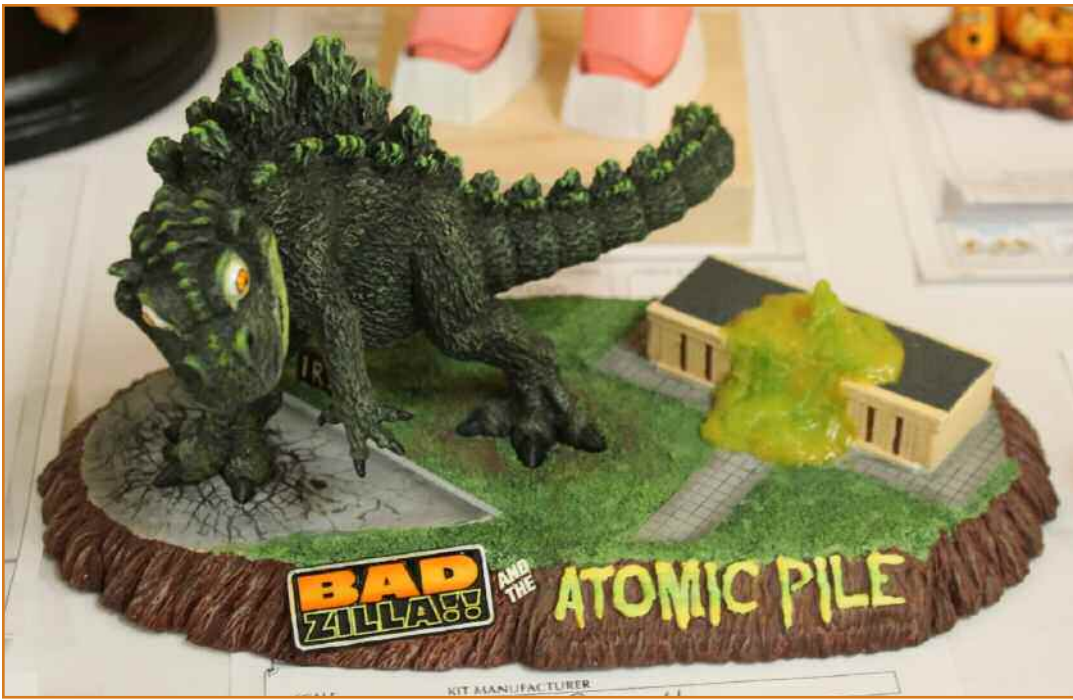
Above: Bad Zilla barfs on a building, thanks to modeler John Pattison. You can't tell from the photo, but (a) the pile of barf is flickering, thanks to a hidden lighting system, and (b) there's a tiny sign identifying the building as belonging to the IRS.