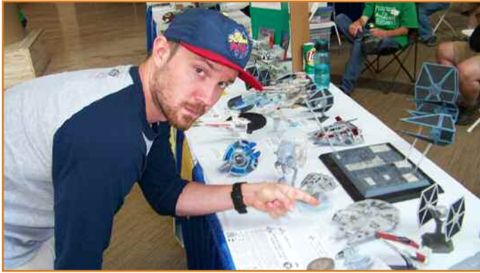
Famous actor Sam Huntington selects his favorite model.

and answer questions from the public, of which there were many. We ran our first ACE Make & Take at this show, and were amazed at the interest—we ran out of models the first afternoon, and had to shut it down for the rest of the show!