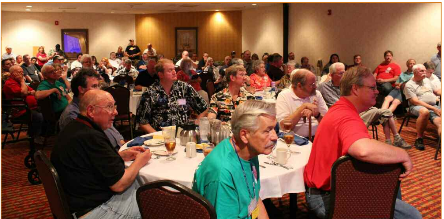
Below: The post-banquet crowd is ready for the awards ceremony!