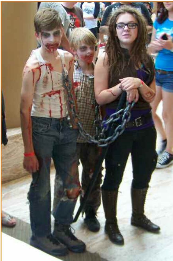
Above: Any fan of The Walking Dead will recognize this.