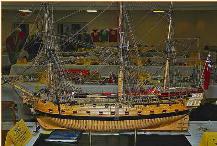
This HMS Isis model won People's Choice and Best of Show.

The dealer room was jammed with vendors of various wares, and it was a rare modeler who was able to venture in there and make it out again without purchasing something!