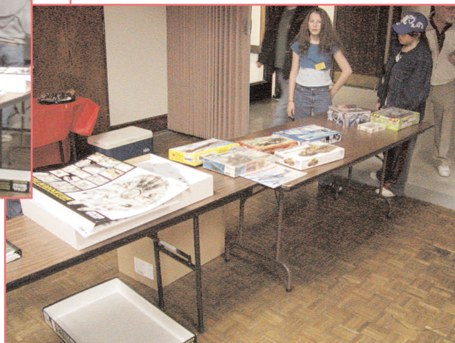
January meeting highlights, L - R: the new E-board gets ready to start the meeting; the raffle table is set up and ready (no, the Millennium Falcon wasn't raffled!).