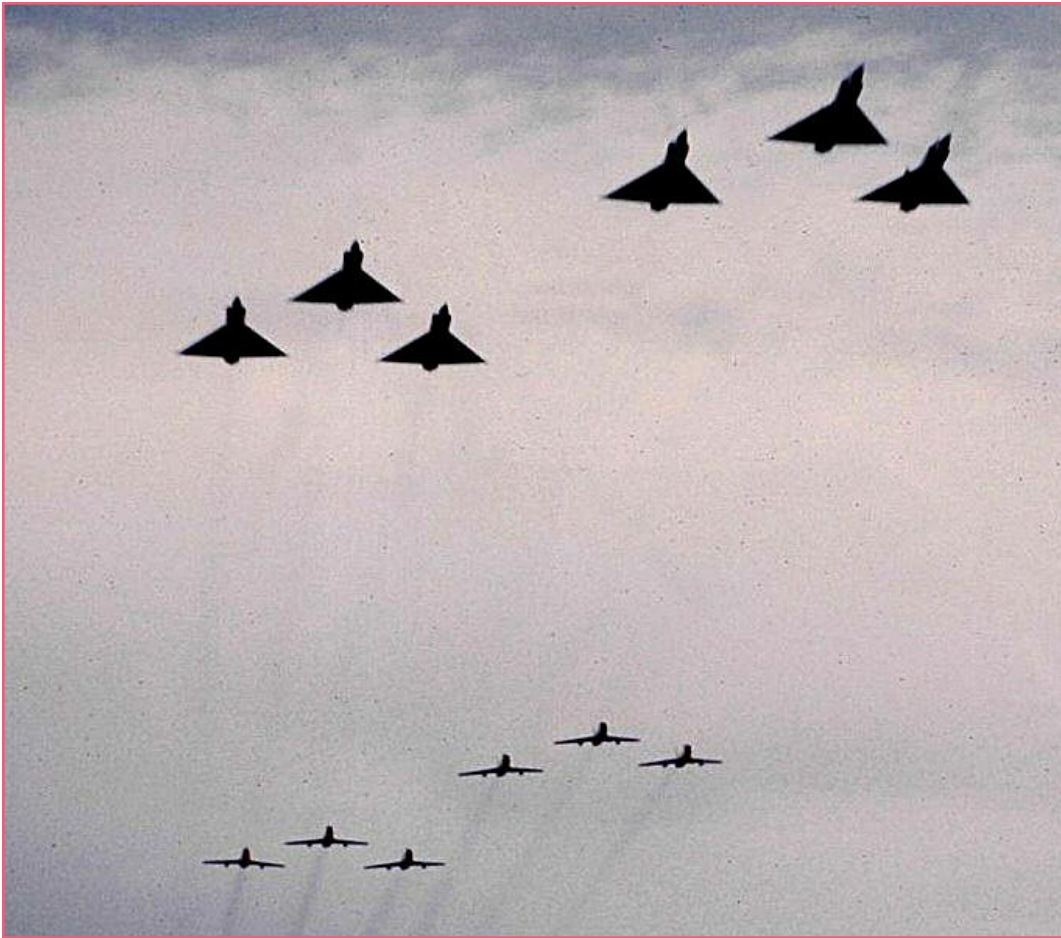
F-86s doing a flyby with F-102s. Note the radar noses on these F-86s!