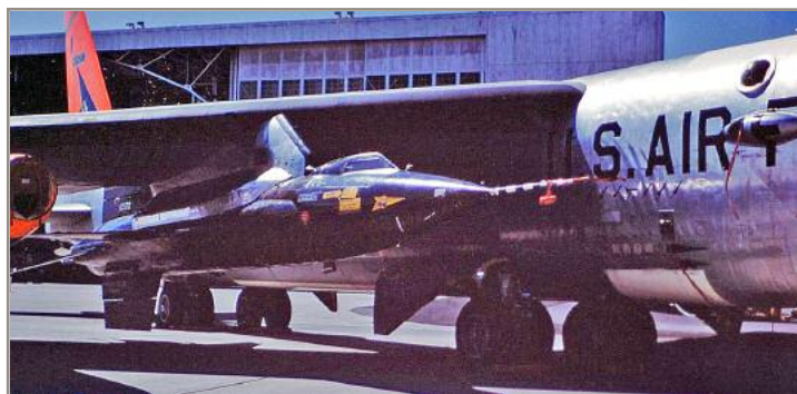
The Air Force Test Center's B-52 on the ramp, and with an X-15 attached under the wing.

This is old stuff now, and we have gone to the moon since then, but in the late 1950s and early 1960s, this was where science fiction and the real world met, and it was exciting to see.