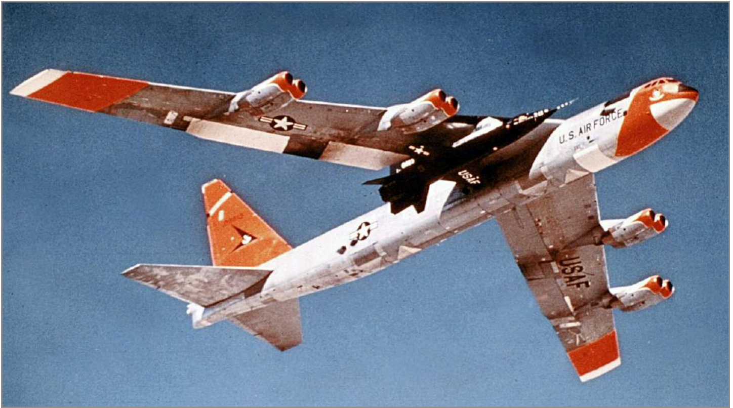
These two photos are Air Force photos, not Fred's! However, Fred acquired them while at these Open House events, so they are contemporary with the subject. Both are marked "Air Force Flight Test Center," and the above image is additionally marked "B-52 and X-15 / First Captive Flight."