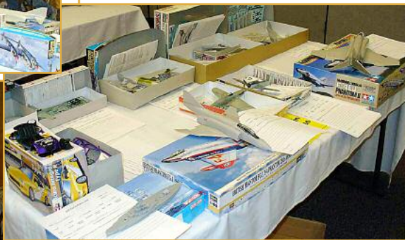
May meeting highlights, clockwise from top: the business meeting, works in progress, and MiG Killers contest winners with their plaques