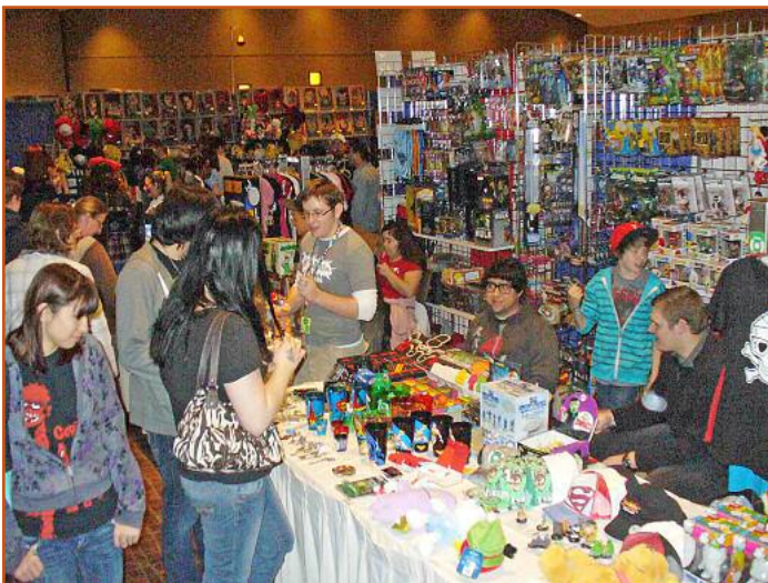
Much to see and buy in the Dealers' Room!

Model kits and such on display and for sale amongst the others posted on the web site ( http://tinyurl.com/asmacc12 )—but Bobetta Fett was pretty good too. Based on what looked like to