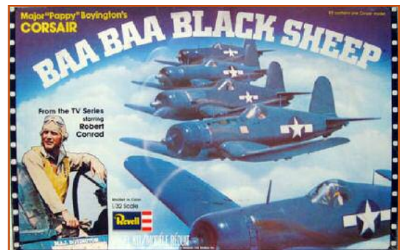
Right: A couple of tie-in model kits based on the series. Did you build them?