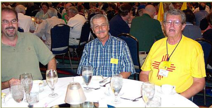
Some familiar faces at a banquet table

Awwwww, the vendors room. Cram-packed with loads of plastic, paints, books, tools, resin, and everything the plastic modeler could desire. This was the one place where everything seemed to go right. Vendors are usually self-sufficient and they were able to make it work without any outside assistance. I was lucky enough to find a few great deals on models (the Special Hobby 1/32 X-15 and P-39D together for $100.00!), and as usual, I spent way too much money there. We'll be eating hot dogs and PBJ sandwiches for a few months at Plastic Model Mecca.