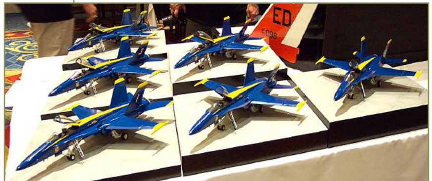
ASM's Chapter Entry, in perfect formation (of course!)

Since there was no announcement or records divulged about which model and modeler placed in which category, I have no way of reporting on the accuracy of the judging. There are several reports that during the judging of the aircraft categories, rulers were handed out, and aircraft were subjected to "equal wingtip height" scrutiny as a means for