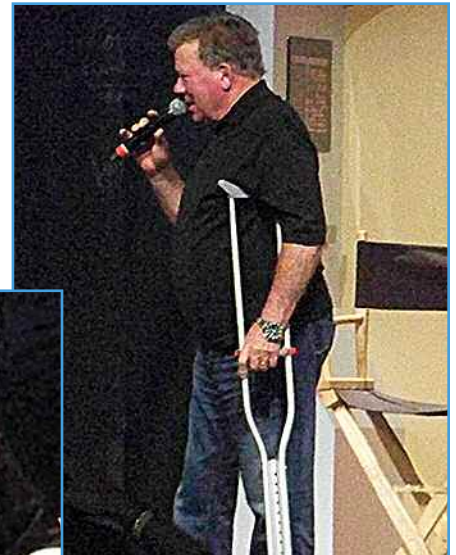
William Shatner arrived bearing a crutch; he had been in a wheelchair a few weeks before at Comic Con as a result of injuries sustained after being thrown from a horse. Clearly he is recovering!

Guests included three from the latest Star Trek movie (Simon Pegg, who plays Mr. Scott; Karl Urban, who plays Dr. McCoy; and Peter Weller, who played Admiral Marcus in the most recent film, Star Trek: Into Darkness ). Weller is also well-known from the original Robocop films as well as Buckaroo Banzai , and was an excellent and engaging guest speaker. Creation has posted short videos from the stage appearances of Karl Urban (click to view) and Simon Pegg if you're interested. Pegg even discusses the infamous Neutron Cream Incident in detail. Urban's video shows clearly the "holodeck door" that was used for guests to enter the stage.