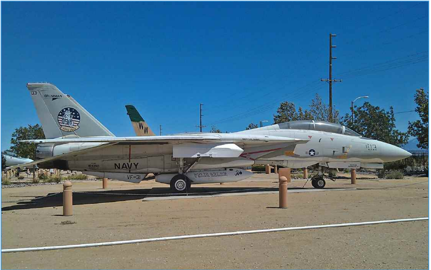
Above: F-14D. Below: F-16, apparently a work in progress.