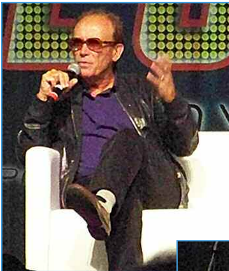
Peter Weller on stage

Guests included three from the latest Star Trek movie (Simon Pegg, who plays Mr. Scott; Karl Urban, who plays Dr. McCoy; and Peter Weller, who played Admiral Marcus in the most recent film, Star Trek: Into Darkness ). Weller is also well-known from the original Robocop films as well as Buckaroo Banzai , and was an excellent and engaging guest speaker. Creation has posted short videos from the stage appearances of Karl Urban (click to view) and Simon Pegg if you're interested. Pegg even discusses the infamous Neutron Cream Incident in detail. Urban's video shows clearly the "holodeck door" that was used for guests to enter the stage.