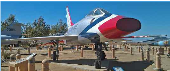
Vehicle, and an F-16 that needs a lot of work. Unfortunately the only World War II era aircraft is a nicely restored C-46D Commando. There are also several types of engines, bombs, and missiles also on display. A 1/2-scale model of the B-2 Stealth Bomber is mounted on a pole near the museum entrance. Overall these aircraft

are in great shape for being in an outdoor display in the hot California desert.