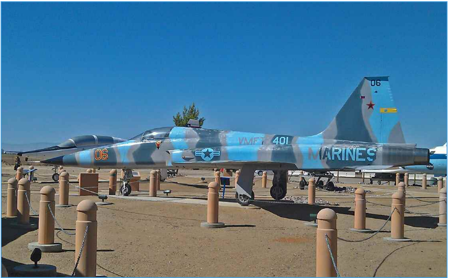
Two variants of the same basic airframe. Above: F-5E. Below: T-38A Talon, a.k.a. the White Rocket.