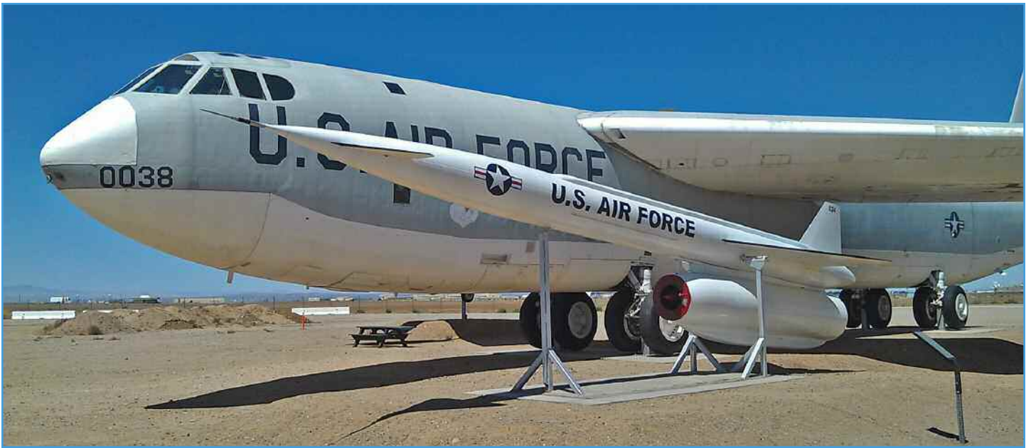
The mighty BUF! B-52D with AGM-28 Hound Dog missile.

[Editor's note: We SAC alumni know it's spelled BUF, with one "F," and we know exactly what it stands for.]