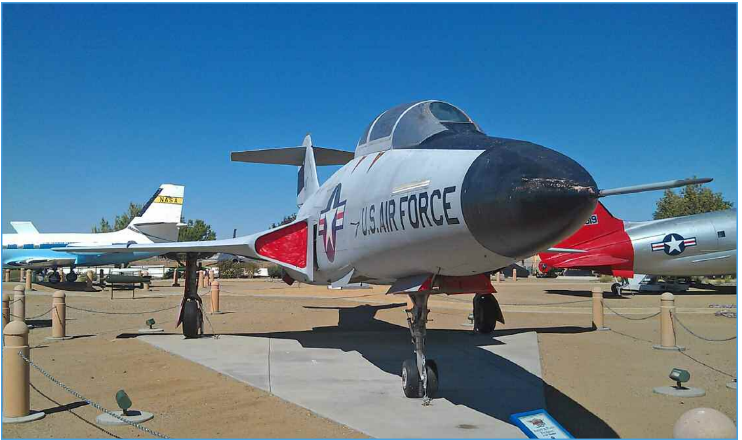
Above: F-101F Voodoo. Below: F-104C Starfighter.