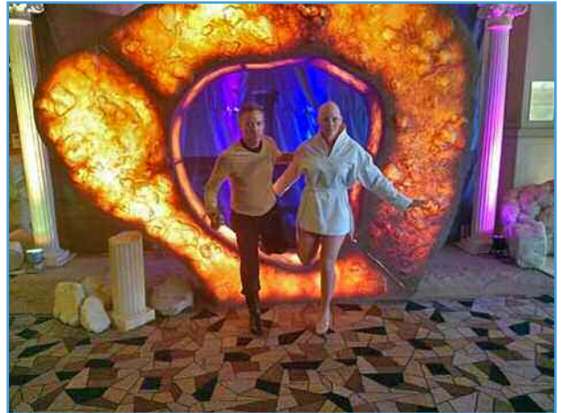
Two costumed attendees pose with the Guardian of Forever

Over 100 guests were present, many on stage (individually or as part of a panel) and several at tables in the Dealer Room. Most of these folks were quite accessible and easy to talk to. Sadly, since the advent of eBay, free autographs are no longer given, but you can usually get a nice hello and a handshake at no charge!