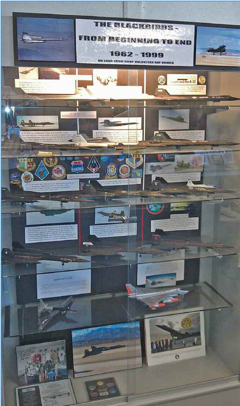
Left: Model display case in the museum/gift shop.