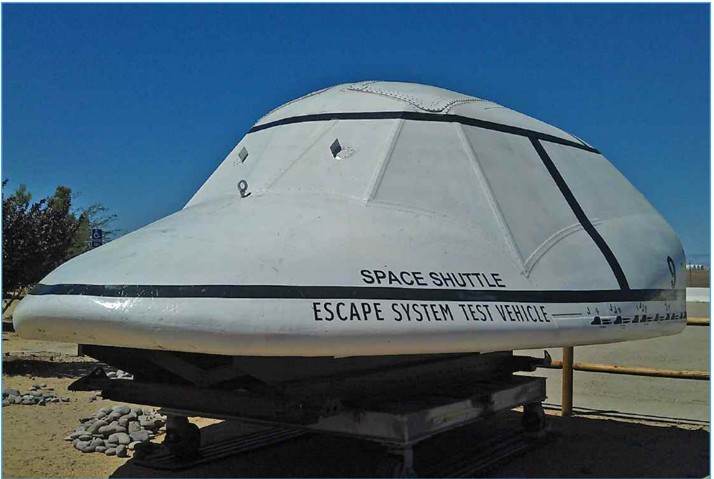
Above: Space Shuttle Escape System Test Vehicle. Below: T-33.