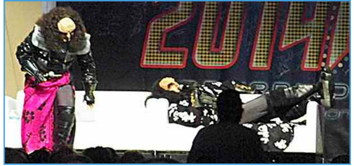
Gowron (L) sports a lovely magenta sarong, while Martok checks out the provided couch.

A costume competition is one of the major draws there, and there were costumed fans to be seen all over the convention.