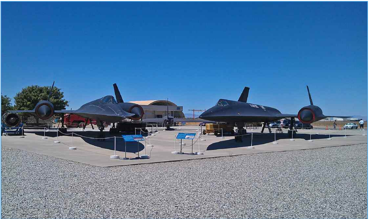
Above, L – R: SR-71A, A-12. The U-2D is visible in the background.