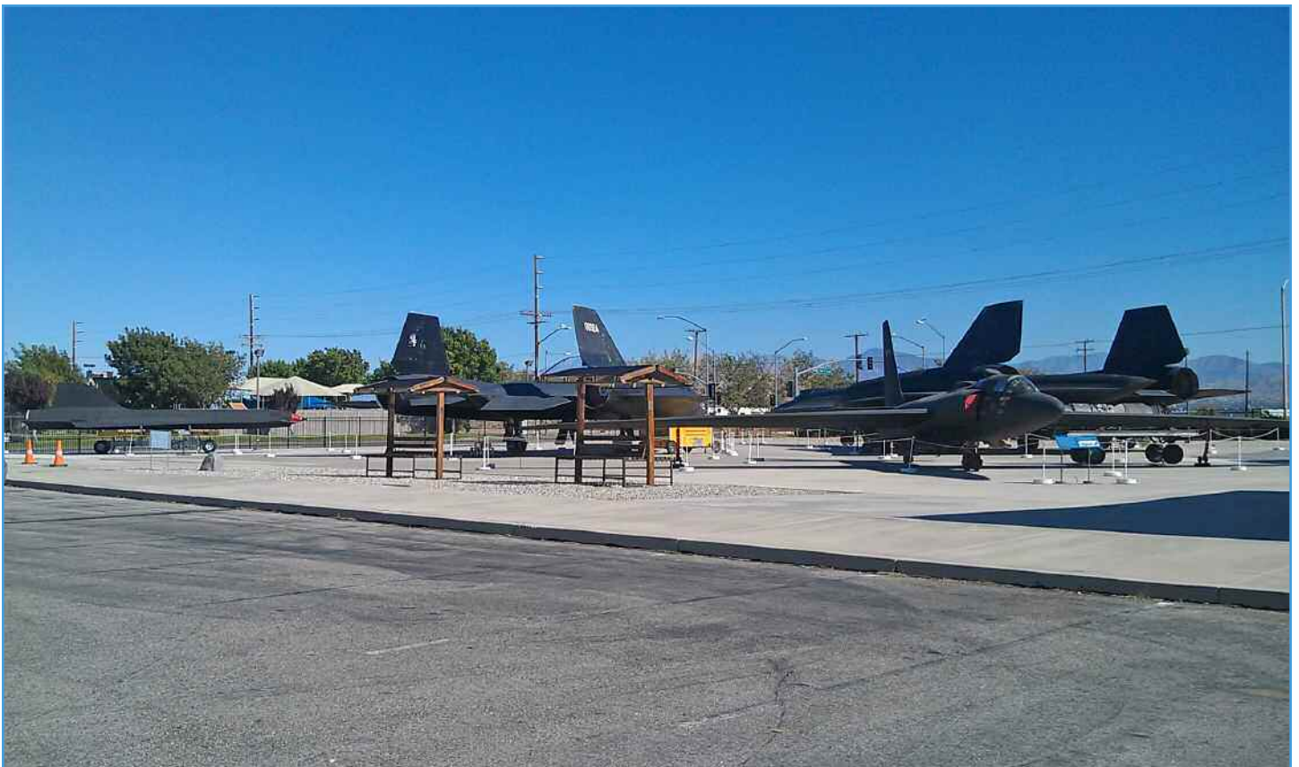
Below: Note the D-21 to the left of the Blackbirds.