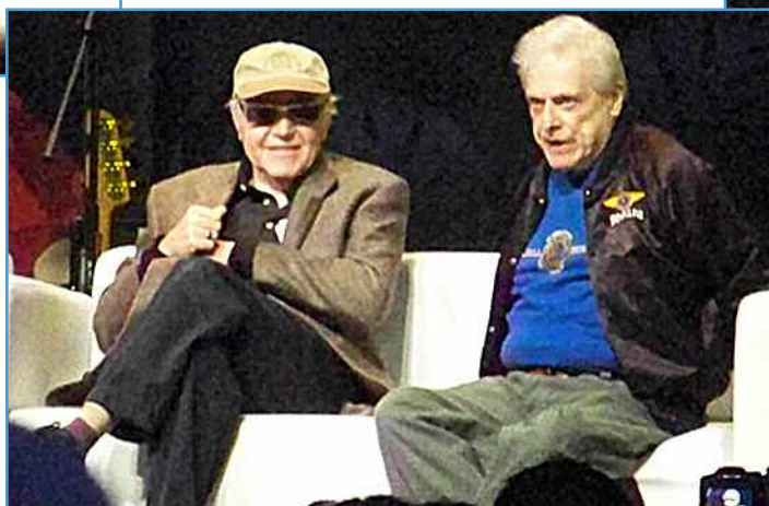
Walter Koenig (L) with author Harlan Ellison, who was attending his first Star Trek convention in over twenty years