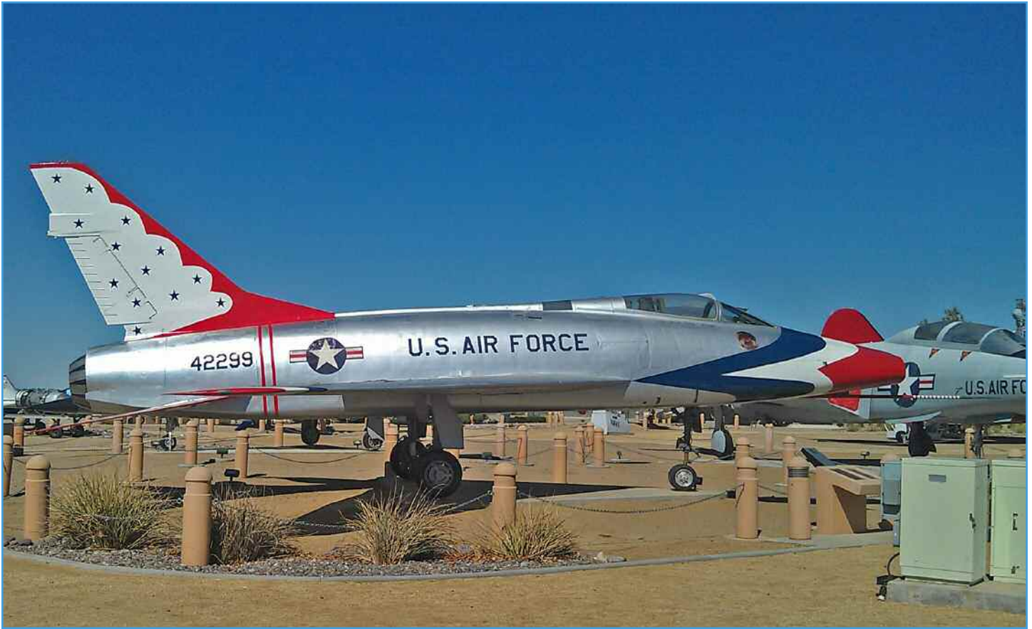
Thunderbirds are go! The F-100D in its distinctive livery.