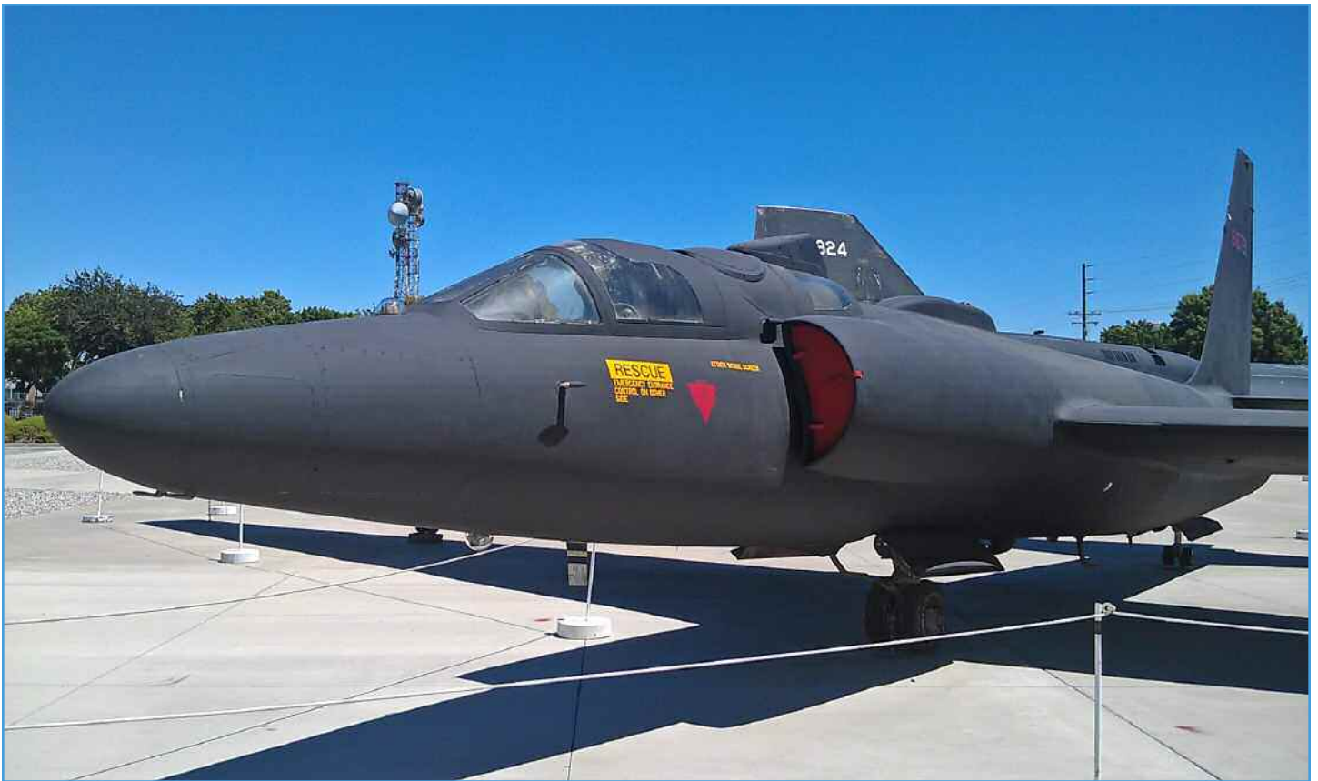
Two shots of the U-2D.