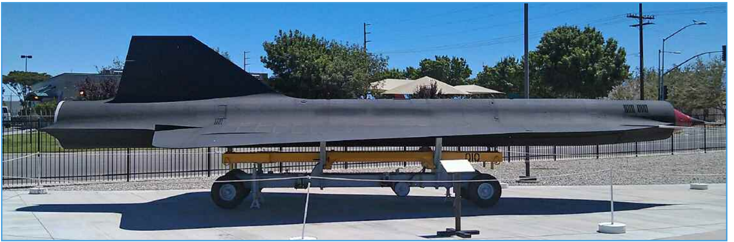
The D-21 Drone.