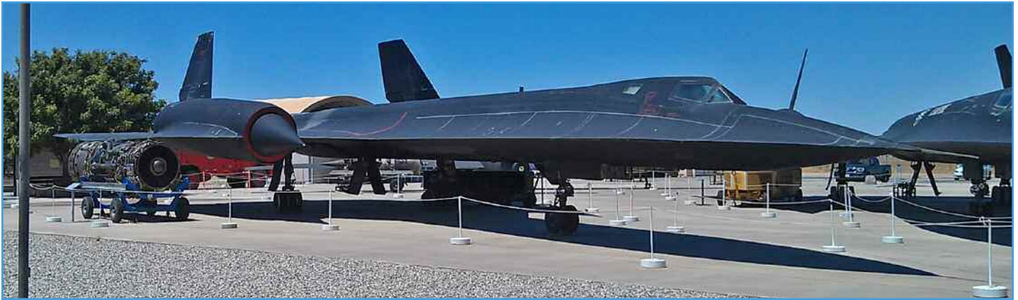
Above: The SR-71A.