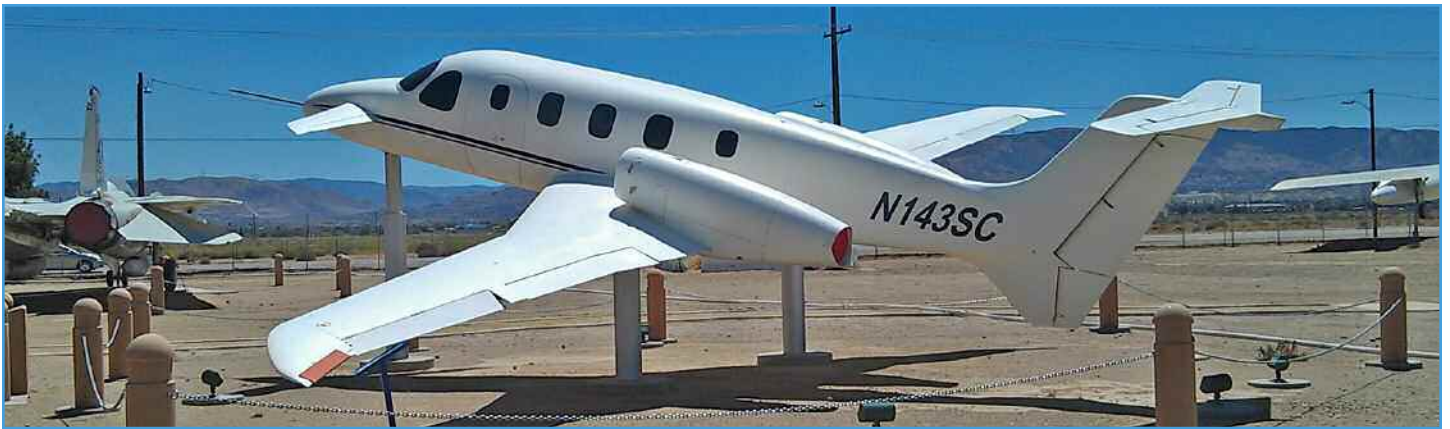
Above: Triumph business jet.

Below: [From the editor] It's sometimes interesting, informative, and even amusing to check out online satellite views of outdoor museums like this one. The upper image is from Google Maps and shows the facility basically as Mike experienced it. At bottom is the same view from Apple Maps (which did locate it in the right place, yes, thank you). There are some differences, implying that Apple's is a significantly older photo. The C-46 is absent in the older photo, though you can clearly see parts of its wings in the parking lot to the north as it awaits restoration. The shuttle test vehicle is present (upper left parking lot), but doesn't yet have its parking barriers in place. And the missile next to the B-52 in the top photo is in the place where the C-46 will later go (and the B-52 is parked closer to the other planes in the older photo). Also, it looks like some of the structures between the two displays have changed a bit, the buildings at the bottom having been heavily renovated. But most interesting of all is the difference in the Blackbirds Air Park at the right: In the Apple photo, the D-21 is absent, but there's an F-117 stealth fighter sitting where the drone will later go! Wonder where that ended up?