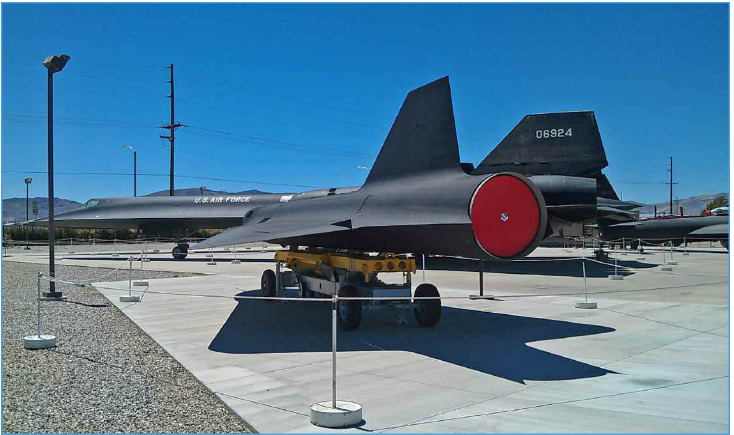
Above: The D-21 drone, with the A-12 in background. Below: The D-21 and the A-12.