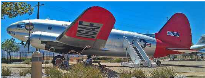
Dog missile, F-100D (former Thunderbird), F-101F, F-104C, F-105G, F-4D, YA-4C (currently in refurbishment), A-7B, F-14D, T-33, T-38A, F-5E, C-140, Triumph business jet, Space Shuttle Escape System Test